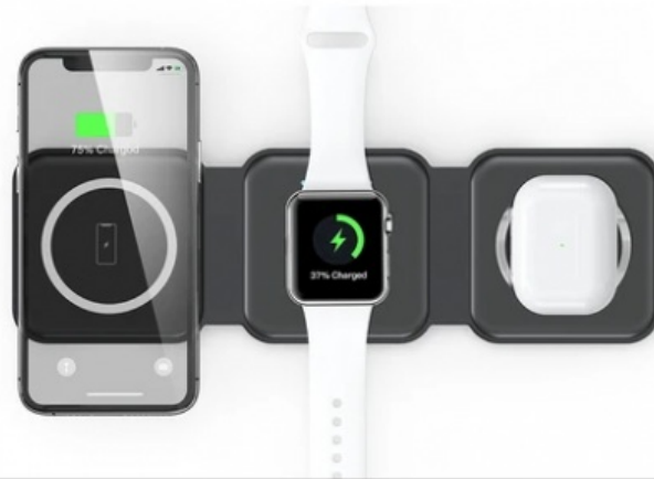
Regular Direct Charge